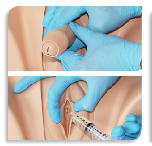
Accurate anatomical modelling