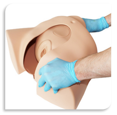
Easily interchangeable units