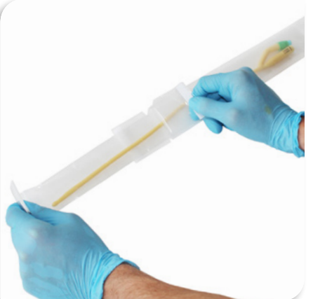
Aseptic catheterisation technique