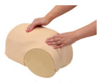
Palpation of uterine fundus