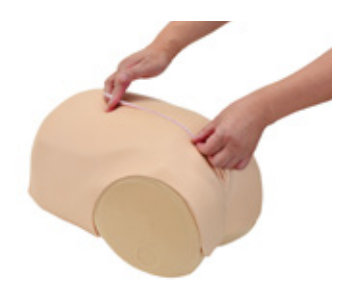
Measurement of fundal height